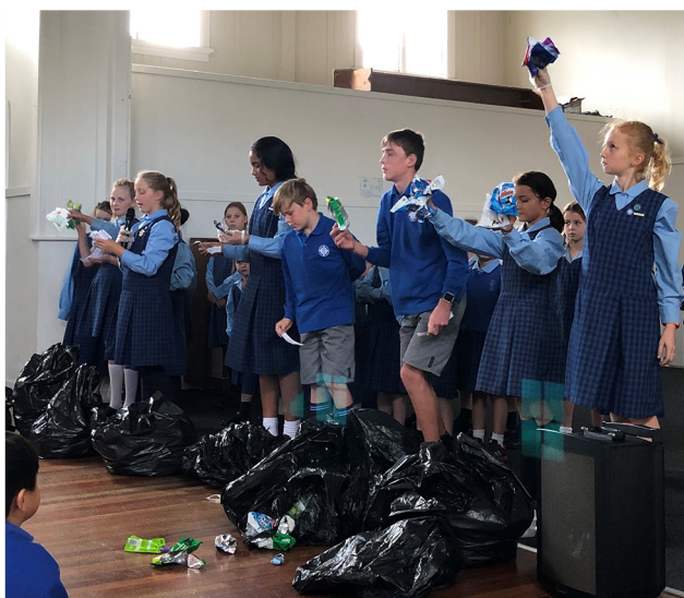
Sustainability Leaders showing the results of one week of plastic waste from our lunch boxes.

Trash-free Tuesdays! will begin Tues 8 May, week 2 of Term 2.